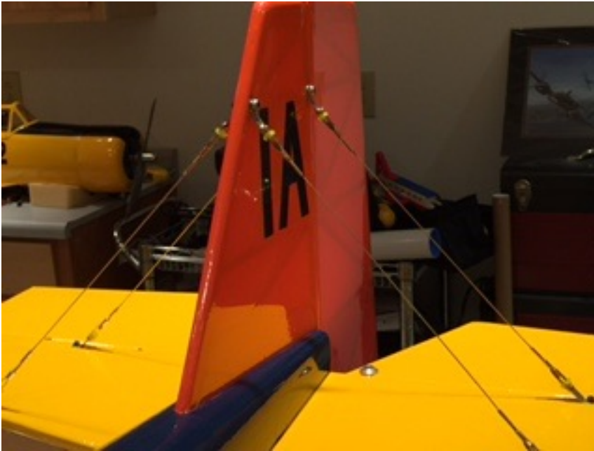
Getting better at soldering. Tail also has wires on the bottom side. Makes for solid section.