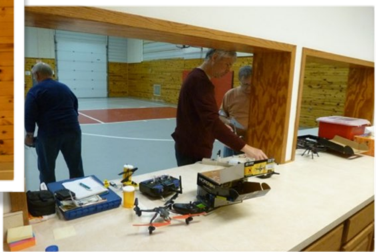
Virtual Reality View!