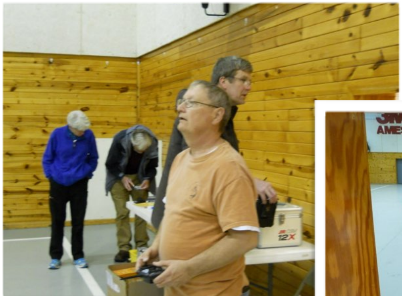
A Fun Flown Night